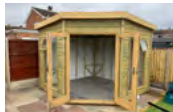
2.4m x 2.4m (8' x 8') Bursledon with Contemporary windows and optional fanlights