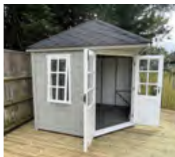
2.4m x 2.4m (8' x 8') Hamble stained in 'Ash Grey' with 'White' accents and fitted black felt tiles and Georgian windows

Offering a wonderful escape during the hot summer months, these delightful corner summerhouses allow you to make the most of every inch of your garden space. Whether you opt for the simple elegant lines of our Bursledon model sitting subtly in the corner of your garden oasis or go for the delightful hipped roof of the Hamble model sited front and centre striking a real statement, you will simply love these stunning, versatile buildings.