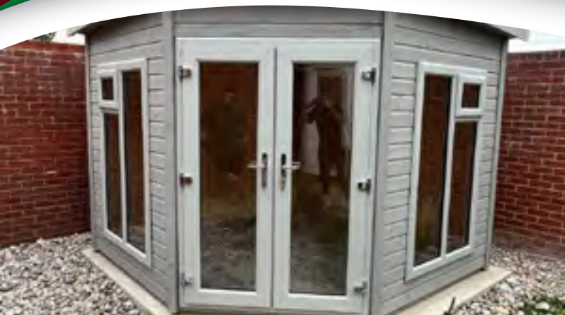
2.4m x 2.4m (8' x 8') Bursledon stained in 'Ash Grey' with optional 'Agate Grey' PVCu door and window upgrade