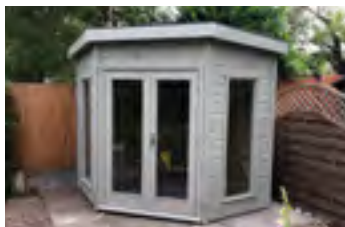
1.8m x 1.8m (6' x 6') Bursledon stained in 'Ash Grey' and fitted with Contemporary windows