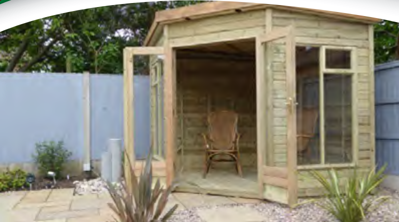
2.4m x 2.4m (8' x 8') Bursledon with Contemporary windows and optional fanlights