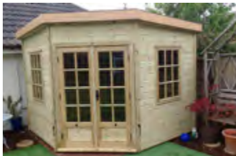
2.4m x 2.4m (8' x 8') Bursledon with non standard Georgian doors and windows