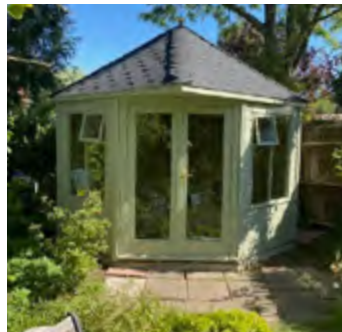
2.4m x 2.4m (8' x 8') Hamble with Classic windows, Black felt tiles and 'Spring Green' paint finish

Offering a wonderful escape during the hot summer months, these delightful corner summerhouses allow you to make the most of every inch of your garden space. Whether you opt for the simple elegant lines of our Bursledon model sitting subtly in the corner of your garden oasis or go for the delightful hipped roof of the Hamble model sited front and centre striking a real statement, you will simply love these stunning, versatile buildings.