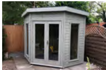
1.8m x 1.8m (6' x 6') Bursledon stained in 'Ash Grey' and fitted with Contemporary windows