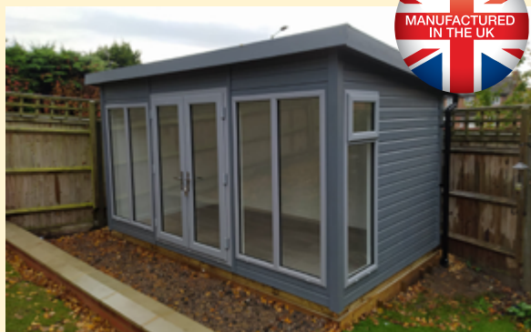
4.8m x 2.4m (16' x 8') Richmond Pent painted in 'Fair and Square' with 'Silver Grey' doors/windows