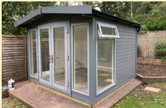
2.4m x 3.6m (8' x 12') Wimbledon Apex painted in 'Gull Grey' with 'Agate Grey' doors/windows