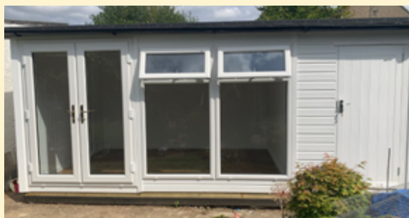
5.4m x 3m (18' x 10') Ickenham Long Ridge Apex with optional integrated store painted in 'White' with 'White' doors/windows