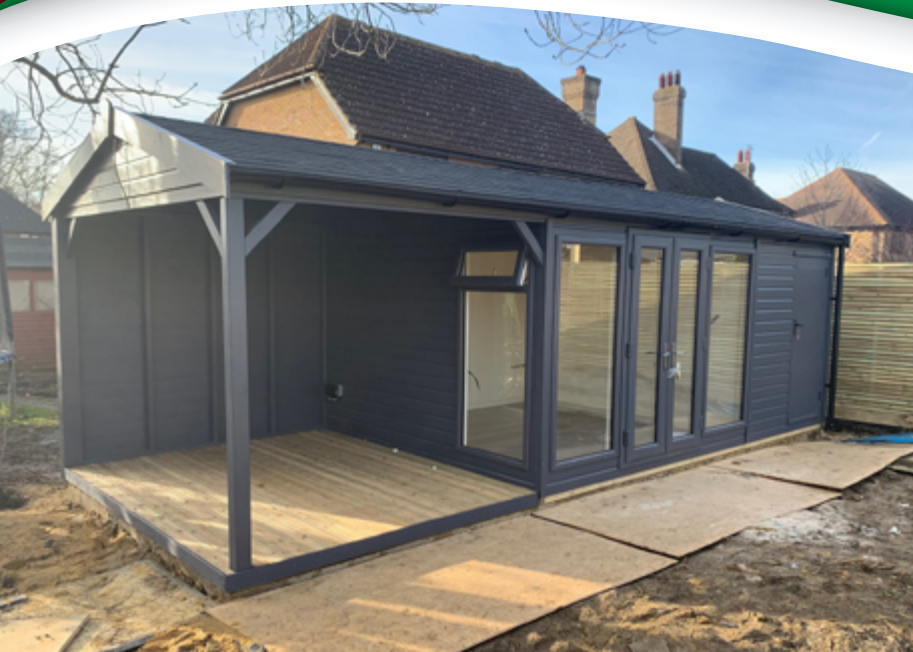
4.8m x 3.6m (16' x 12') Ickenham with optional 4.8m x 4.8m (12' x 12') open area for a hot tub. The building has been painted in 'Slate Grey' with 'Slate Grey' doors/windows