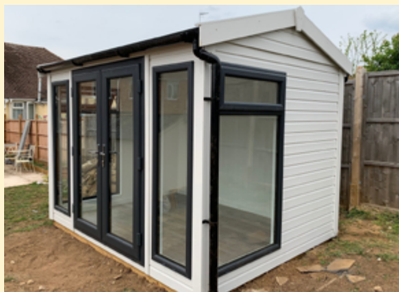
3.6m x 2.1m (12' x 7') Ickenham Long Ridge Apex painted in 'Light Grey' with 'Anthracite Grey' doors/windows