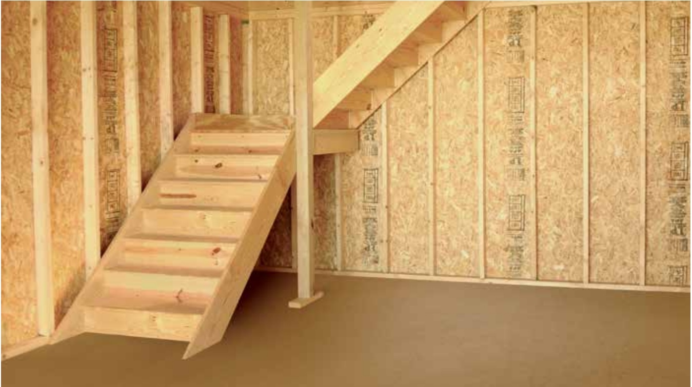
Featured: LP® StrongCore™ Cladding