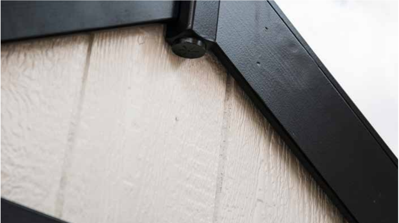
Featured: LP® StrongCore™ Cladding with SmartFinish™